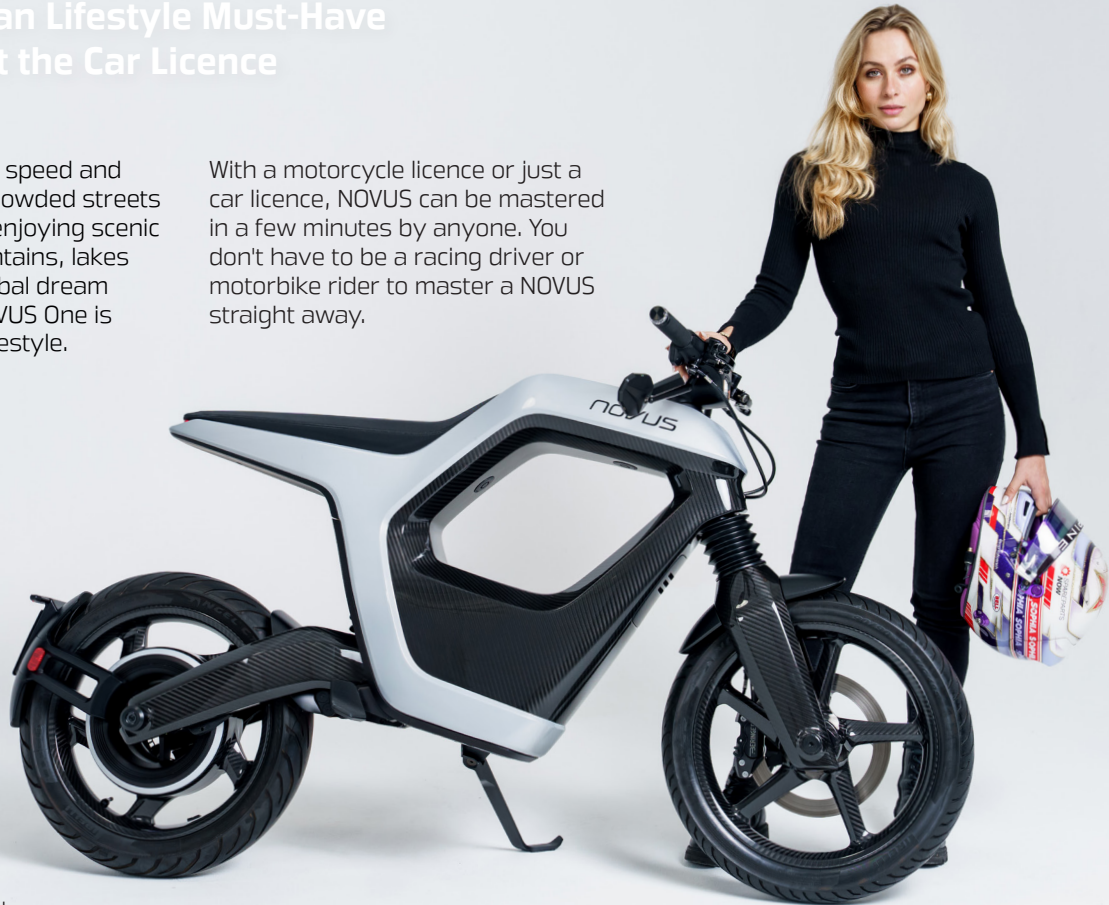
Sophia Flörsch NOVUS Angel Ambassador Most-Influential Female Racing Driver

With a motorcycle licence or just a car licence, NOVUS can be mastered in a few minutes by anyone. You don't have to be a racing driver or motorbike rider to master a NOVUS straight away.